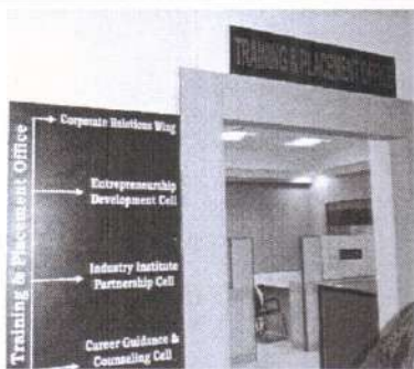
Training & Placement Office