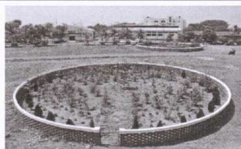
1 st Year Boys' Hostel, Work Shop (Girls' Hostel & Sr. Boys' Hostel are