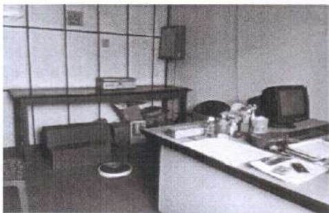
Medical Unit with Bed