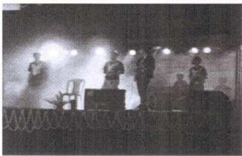
Student Annual Programme